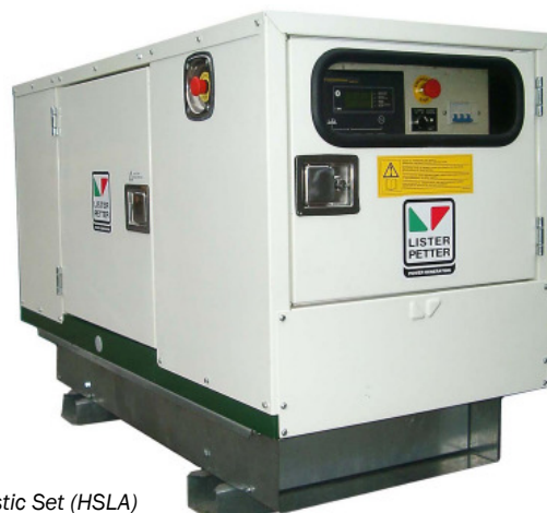
Acoustic Set (HSLA)