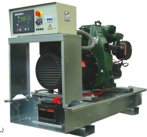
Open Set (HSL)