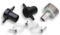
For TR 2.36 H