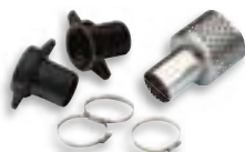
For TR 3.60 H