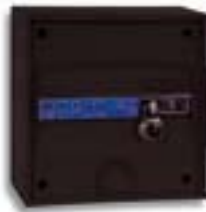
Ref. Verso T*

*Includes the adapter + auto pack (battery charger + preheater)