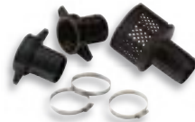
For HP 2.26 H and XC 2.34 H