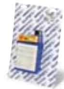
Ref. R18 et R19

10 maintenance kits for CH 270 KOHLER® engine.