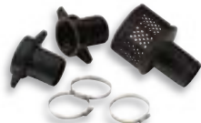
For ST 3.60 H