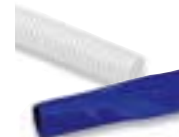
For CLEAR 1: 5m intake hose + 10m output hose