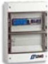
Ref. Verso M*