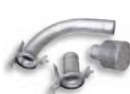
For TRASH 4