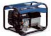
PERFORM 5500 T