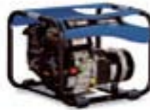
PERFORM 6500 C