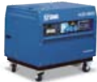
ALIZÉ® 6000 E