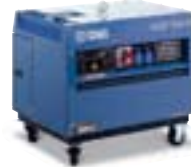
ALIZÉ® 7500 TE